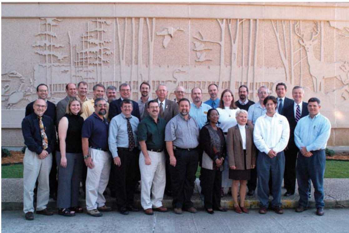
Louisiana Aquatic Invasive Species Task Force, October 2003.